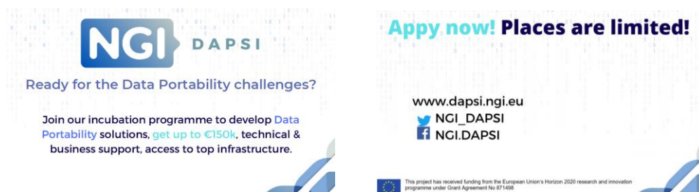
FIGURE 6: DAPSI BUSINESS CARD

Business card are an affordable solution that can be used in situations where a follow-up contact is potentially needed.