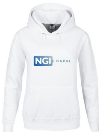
FIGURE 8: DAPSI HOODIE