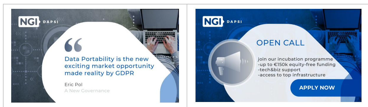
TABLE 3: SOCIAL MEDIA POST ILLUSTRATIONS

In order to increase the visibility of each post, retain the viewers' attention, and reinforce the different messages, a set of post illustrations were developed.