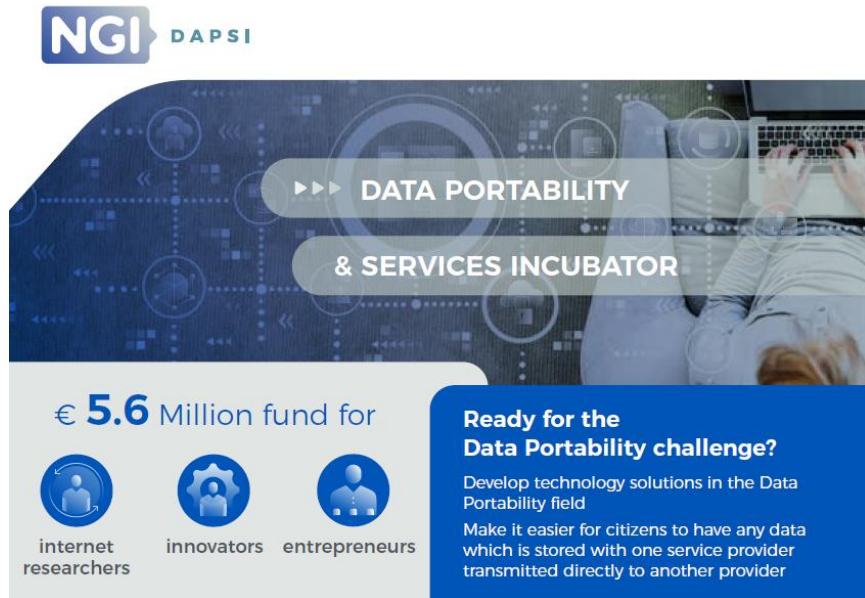
FIGURE 4: DAPSI POSTCARD (FRONT)

Postcards are a communication option of smaller size compared to the previous ones and have the potential to be turned into a digital and dynamic visual component saving it as a Graphic Interchange Format (.GIF).