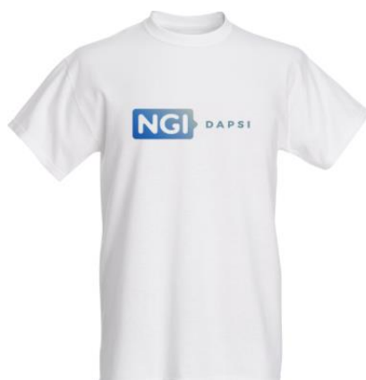
FIGURE 7: DAPSI T-SHIRT