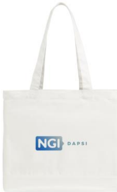
FIGURE 9: DAPSI BAG