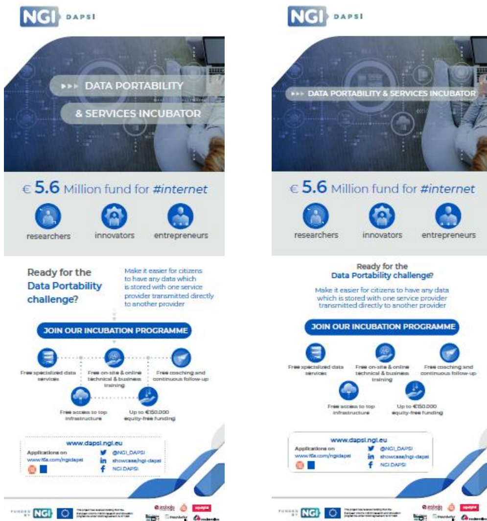
FIGURE 1: DAPSI ROLL-UPS

To establish the visibility of DAPSI at major logistics conferences and in person meetings, DAPSI roll-up designs have been developed. They will be produced in English. They follow the original visual identity of DAPSI in order to facilitate the recognition of the roll-up as one of the parts of the DAPSI visual elements family, both online and offline.