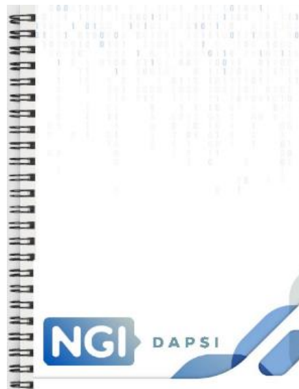
FIGURE 10: DAPSI NOTEBOOK