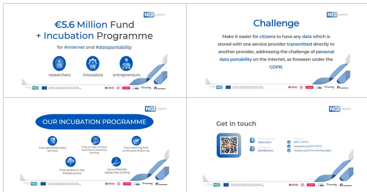
TABLE 1: DAPSI PRESENTATION SCREENSHOTS

The DAPSI open call presentation is a Microsoft PowerPoint template presentation comprising of few slides introducing the project, the challenges, the eligible applicants, timeline, funding opportunities, DAPSI technical and business support and contacts.