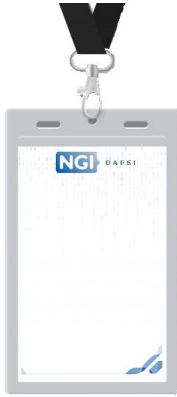
FIGURE 11: DAPSI ID BADGE